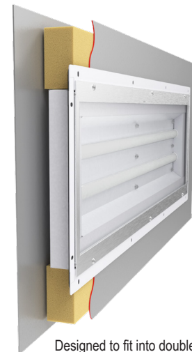
Designed to fit into double wall booths. Fixture recess depth 2.13 in.