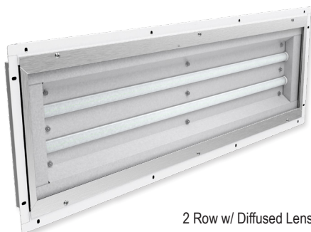
2 Row w/ Diffused Lens