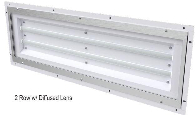
2 Row w/ Diffused Lens

The LE485E Series is a recessed mount, front access, LED paint booth luminaire. This LED fixture is available in 4 Ft. lengths with 1 or 2 rows of LED's; replacing your standard 4 lamp fluorescent fixture. The LE485E Series fixtures is designed to fit into a double wall booth. This fixture can be used with or without optics, has dimming capabilities, and is available with an EM option. Designed as a cost effective and energy efficient solution to replace or upgrade your booth to LED lighting.